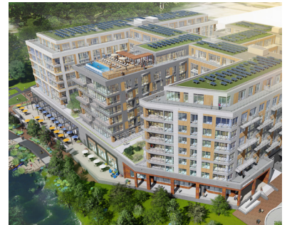
River Point, Washington, DC 2121 1st Street SW Rendering - View Looking Northwest