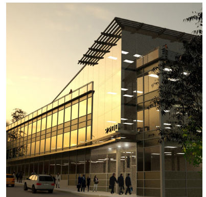
Shannon Place, Washington, DC Courtesy of PGN Architects