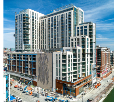
Liberty Harbor East, Baltimore, MD

Jasmine Lofts - 611 M Street NE | Washington, DC - completed Major renovation of an existing 4-unit apartment building